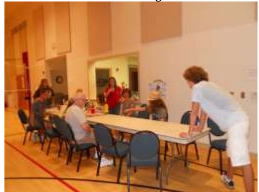
Pitt Pres Youth Open Gym Game Night