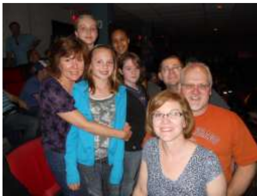
Pitt Pres Youth @ Third Day Concert