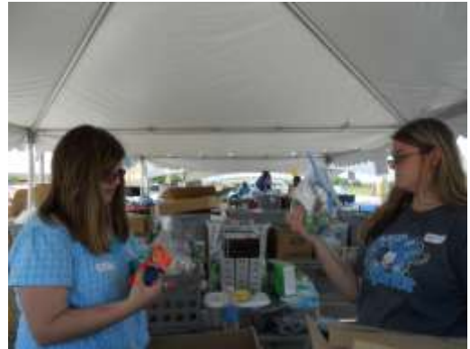
Pitt Pres Youth helping Joplin